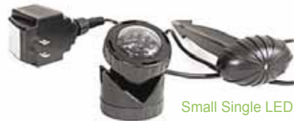
Small Single LED