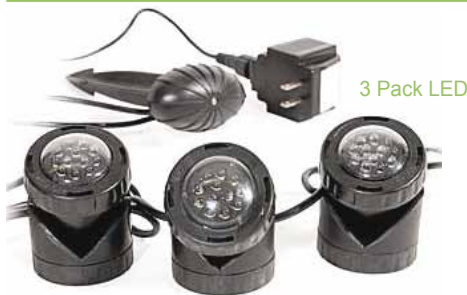
3 Pack LED