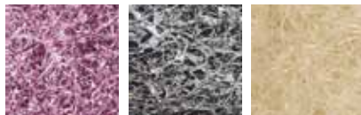
Fusion Black Cream