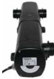
CUV-18 UV Clarifier